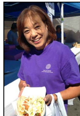
You'll find fresh produce and delicious food at the Bazaar!