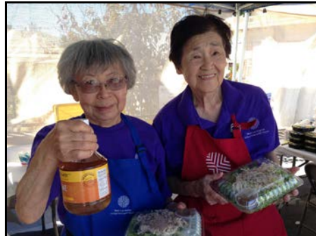
Good food and friendly faces are highlights of the Asian Cultural Bazaar!

Our annual West Los Angeles United Methodist Church Asian Cultural Bazaar will be held on Saturday, September 20, from 11:00 AM to 5:00 PM with food, entertainment, children's games and crafts, a silent auction, plants, door prizes and cultural displays!