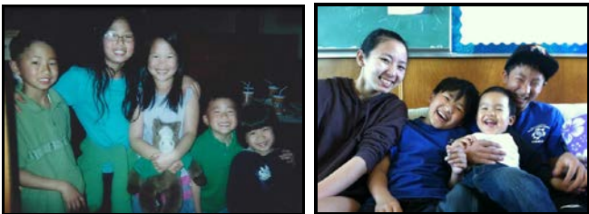
Ohana 1.0 – Then and Now!